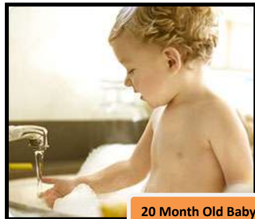
20 Month Old Baby

The natural milk from the mother is for the young infant, alkaline and nonmucus-forming; and it is a perfect food (if the mother is eating properly and leaving harmful substances such as coffee, liquor, drugs and tobacco alone) which will build good teeth, healthy tissue, and strong bones. The baby's body will accept this perfect alkaline diet (wherein nothing else is needed) until it cuts its eye teeth and its stomach teeth (usually at 18 to 20 months of age). When these teeth come through, it is nature's signal that the gastric juices have started to flow , and as these now mix with the milk, it now becomes acid to the baby. From that time on, the milk will have the opposite and unhealthy effect. It forms into mucus, causing sinus problems allergies, colds, tooth deterioration, etc. So at this time, the child must be taken off milk and put onto an alkaline diet: the mucusless fruits, vegetables, and juices.