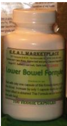
Lower Bowel Formula #1 100ct Bottle

By the end of the first week you, should know what your dosage is. If not, then remain on this formula alone for an additional week to get regulated before you go on to the next step.