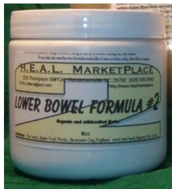
Lower Bowel Formula #2 8oz Jar