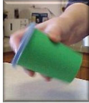
Shake & Drink